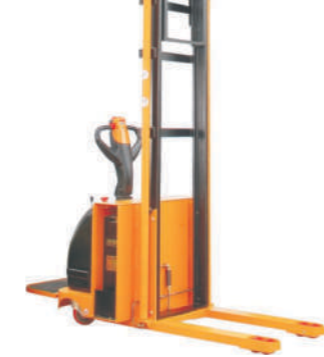
ST15 WC (Wide Chassis)